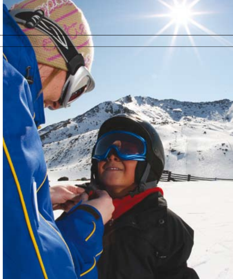
Above: Mt Hutt's The Blue Pub is one of many places for après-ski delights (left). Gearing up for another day on Mt Hutt's slopes (right).

MT HUTT Ski there until :: 19 OCTOBER +64 3 302 8811 www.nzski.com BED DOWN :: Ski Time +64 3 302 8398 www.skitime.co.nz :: Terrace Downs +64 3 318 6943 www.terracedowns.co.nz CHOW DOWN AND DRINK UP :: The Blue Pub +64 3 302 8046 www.thebluepub.co.nz :: Forest Lodge +64 3 302 8116 www.forestlodge.co.nz :: The Last Post Cafe +64 3 302 8259 :: Steel-Worx +64 3 302 9900 www.steel-worx.co.nz